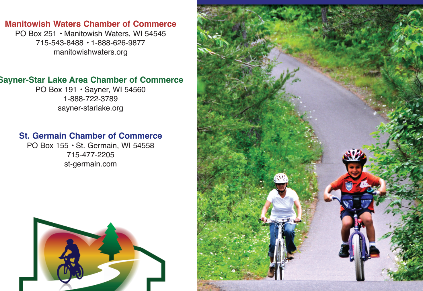
Boulder Junction • Manitowish Waters Sayner/Star Lake • St. Germain