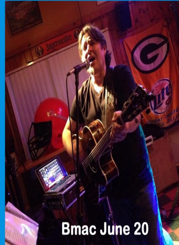
Bmac June 20

Wednesday Evenings, 7pm to 9pm, next to Peepelures Rain Back-Up Location, Boulder Junction Community Center