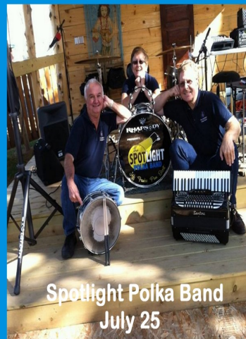
Spotlight Poika Band July 25