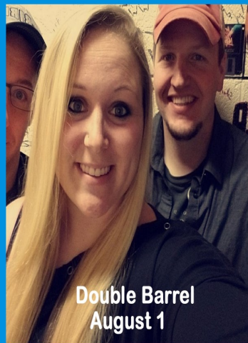
Double Barrel August 1