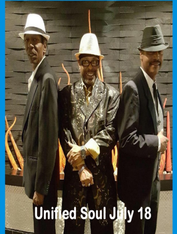
Unified Soul July 18